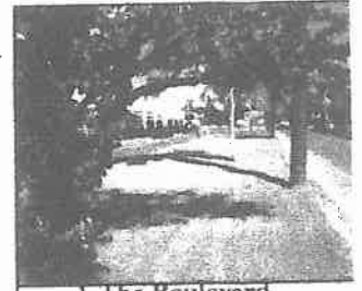
1. The Boulevard

Start your day off in the neat town of Theodore. It's palm-lined roads are quite spectacular and the town is an impressive look-alike to the street plan of Canberra. Though it is local hear say that Walter Burly Griffin architecturally designed the town, he in fact didn't. More so, Theodore was designed along the lines of other Irrigational towns, especially in NSW.